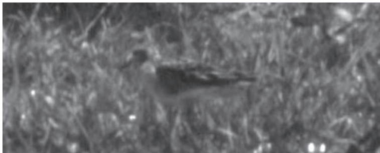
Figure 3. Sharp-tailed Sandpiper ( Calidris acuminata ), November 2001. Judged to be similar in size and structure to a Pectoral Sandpiper ( Calidris melanotos ) in the field, but showed a contrasting rufous cap, buffy breast, and rufous edging on tertials. The fresh appearance in the field, and color patterns suggest it is a juvenile.

Easter Island is one of the world’s starkest examples of how humans can severely impact natural ecosystems, yet relatively little is known about the contemporary avian community of the island, and how the community has changed through recent time. Our results represent the first quantitative description of the contemporary avifauna on Easter Island, and raise the total number of species known from the island to 49. We show that there are presently five common exotic terrestrial species, and although these species vary in abundance, this variation was not predicted by variation in habitat characteristics. We also observed ten seabird species, seven of which showed evidence of breeding. It is known that a mass extinction