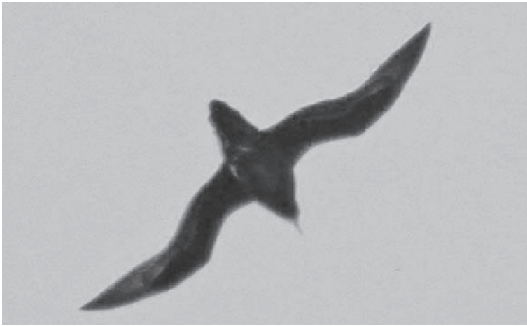
Figure 4. Henderson Petrel ( Pterodroma atrata ), 4 March 2003. This Pterodroma was similar in structure to adjacent Herald Petrels, but seemed slimmer winged, longer-tailed and rounder bodied. It was entirely dark brown, except for a whitish patch on the patagium, and some pale on the chin. The primary shafts were entirely dark, and the underwings showed a slightly paler silvery look when compared to the more matte coverts. The legs were pink with black feet.

of birds followed Polynesian colonization, and we show that in recent decades the exotic and native avifauna has remained relatively stable. Conservation efforts are still needed, however, as existing seabird nesting sites are small and few in number.